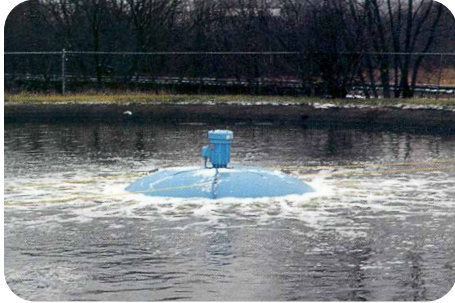
Aqua-Jet II® aerator operating in a cold weather application.

The Aqua-Jet II® contained flow aerator is designed and manufactured with the same expertise and quality workmanship as the industry renowned Aqua-Jet® aerator. The 304 stainless steel volute and intake cone are standard features of the Aqua-Jet II. A one-piece motor shaft of 17-4 stainless steel and dynamically balanced propeller of 316 stainless steel are also standard. The dome shaped cover assembly is constructed of fiberglass reinforced polyester (FRP) for spray control.