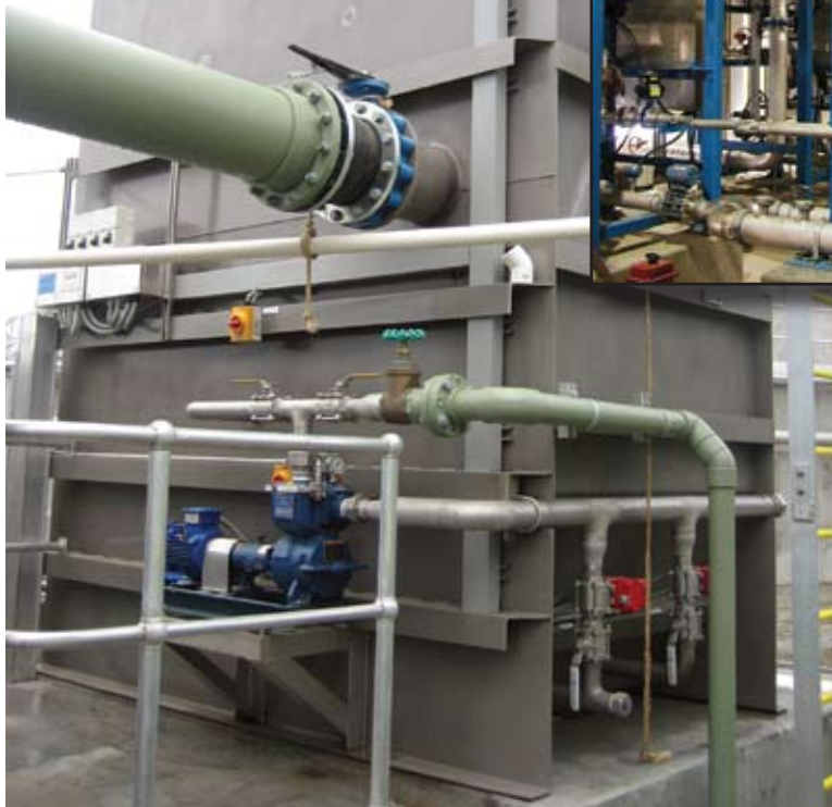
Figure 2. St. Helens WWTP Multiple-Barrier Treatment Process* * Consists of a 2-basin sequencing batch reactor, cloth media disk filter, and external membranes.