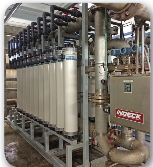
(1) Aqua MultiBore® Membranes module in Train 2.

In April 2014, Butler decided to conduct a 9-month pilot study with (21) Aqua MultiBore® membrane modules retrofitted into Train 2. Train 2 was tested alongside the other (3) UF trains and proved the superior performance