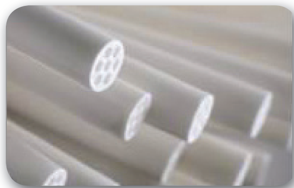
Aqua MultiBore® membrane fibers.