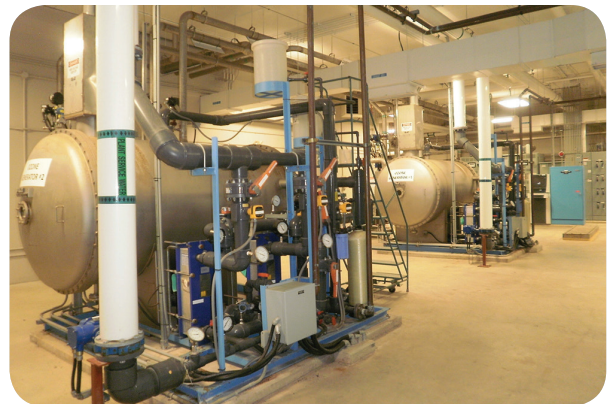
Multiple Ozone Generators at the Burlington Plant (550/kg/day)

The ozone treatment system was able to eliminate foul tastes and odors brought on by the algae blooms, resulting in a 50% reduction in the number of complaints to the Municipality about the taste of the water. The flocculation and separation of particulate matter earlier in the treatment process reduced the load on the plant filtration systems, nearly doubling the runtimes of the filters between backwashing. Disinfection byproducts such as THMs and HAAs were reduced by 30-40% on average, due to precursor elimination by way of ozone oxidation.