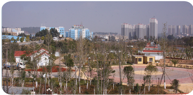
Aerial view of the public park and residential area located above the Kunming Puzhao underground treatment plant.

The Kunming Puzhao Wastewater Treatment Plant (WWTP) located in Kunming, Yunnan Province, China is unique because it was built completely underground, due to limited land space available to accommodate such a large capacity plant. The facility operates below a public park that is surrounded by residential buildings.