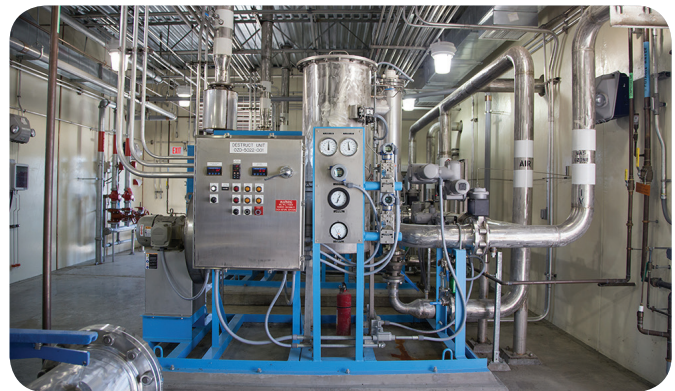
Ozone Destruct System

Since startup, the ozone generation systems have consistently met or achieved their treatment objectives, preventing the formation of DBPs within the guidelines of the D/DBP2 rule and below the stipulated Maximum Contaminant Level for these byproducts. The state-of-the-art control system has also provided greater flexibility to the Wylie plant operators, allowing fine-tuning of ozone dosage in order to effectively respond to taste and odor events precipitated by the algae blooms. This important, cutting-edge upgrade will allow the NTMWD to provide safe, clean, great-tasting water to their millions of customers for many decades to come.