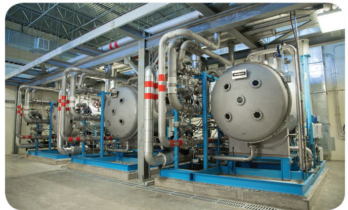
3900 PPD (12%) Generators at Wylie, TX

Facing new limits on acceptable levels of DBPs in the drinking water, as well as age-old complaints about the taste of the water during the summer algal bloom, the NTMWD turned to ozone disinfection as a possible alternative able to address both concerns. After carefully reviewing the alternatives, the NTMWD made a decision in 2008 to begin developing plans for an ozone treatment system, and in 2009 selected Metawater USA as the