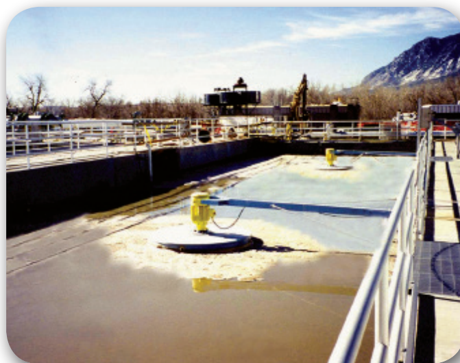
One of five anoxic basins utilizing AquaDDM® mixers with a pivotal mooring arm.