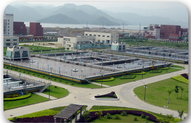
One of three Aqua MSBR ® reactors at the Shenzhen Yantian WWTP.

Following their investigation of nutrient removal technologies, the city chose to install an Aqua MSBR modified sequencing batch reactor system. Plant construction was divided into two discrete phases. The first phase began in early 2000 and the second in December of 2001.