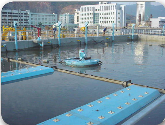
One Aqua MSBR ® cell at Shenzhen Yantian WWTP. Shown is (1) AquaDDM ® mixer with local control station and (2) Air Weirs.

Increasingly stringent permit limits on effluent BOD 5 , COD, TSS, Ammonia-Nitrogen and Total Phosphorus determined the need for a new wastewater treatment plant. Due to the limited land space and environmental sensitivity of the port area, Shenzhen had to design a new plant with technology that offered a small footprint and enhanced nutrient removal capabilities that addressed the particularly stringent Total Phosphorus discharge limits.