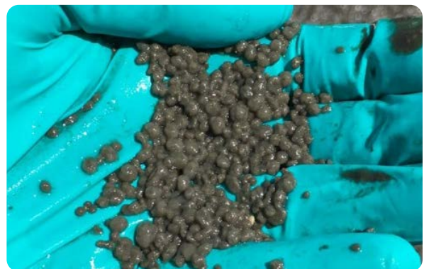
Granule sample following sieve testing at the AquaNereda® demonstration facility, Rockford, IL