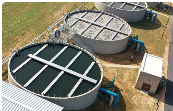
Three AquaNereda® reactors show compact design, typically 50% of a conventional plant.