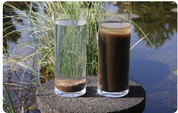
SVI 5 comparison of aerobic granular sludge (left) and conventional activated sludge (right)