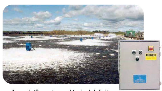
Aqua-Jet® aerator and typical definite purpose control panel

Applications include: Aqua-Aerobic batch reactor systems, phased activated sludge systems, cloth media filters, membrane systems, aeration control, and plant-wide auxiliary systems.