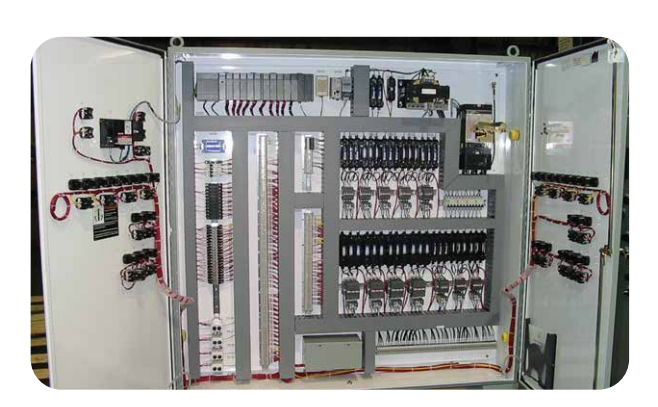
Configurations for custom applications

Applications include: Aqua-Aerobic batch reactor systems, phased activated sludge systems, cloth media filters, membrane systems, aeration control, and plant-wide auxiliary systems.