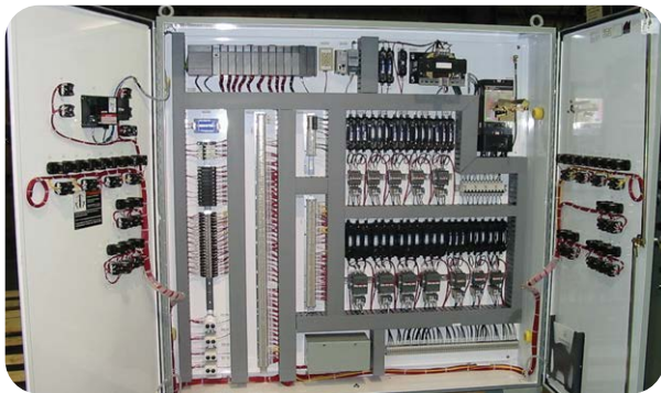
Configurations for custom applications

Applications include: Aqua-Aerobic batch reactor systems, phased activated sludge systems, cloth media filters, membrane systems, aeration control, and plant-wide auxiliary systems.