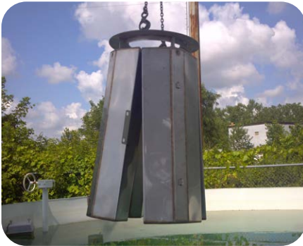
The segmented Fold-a-Float is compact and ideal for applications that require limited hatch access.

The float unfolds as it meets the surface of the water and ready for the power section to be installed.