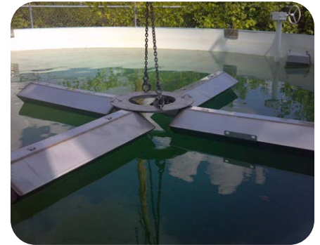
The Fold-a-Float in full-deployment.

View our Fold-a-Float® Installation Video >