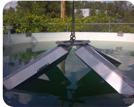
The Fold-a-Float begins to self-deploy as it meets the surface of the water.