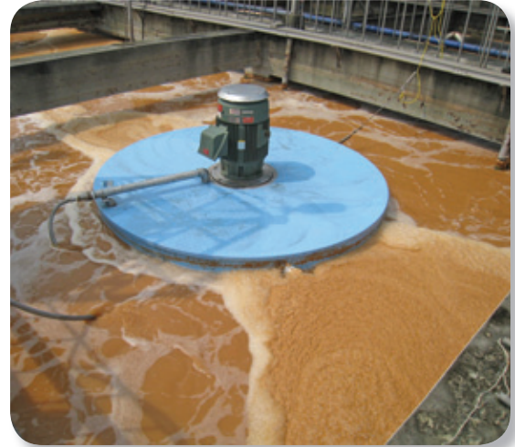
OxyMix ® Pure Oxygen Mixer in operation.