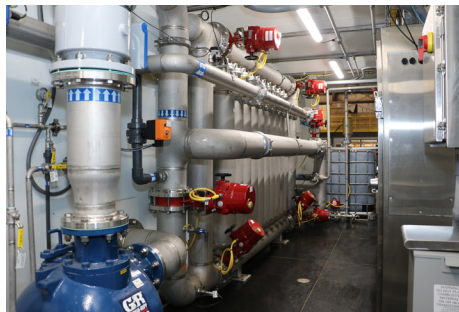
Interior View – AquaPRS™ Separation System