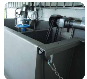
External view of the compact filter tank using OptiFiber® pile cloth media.