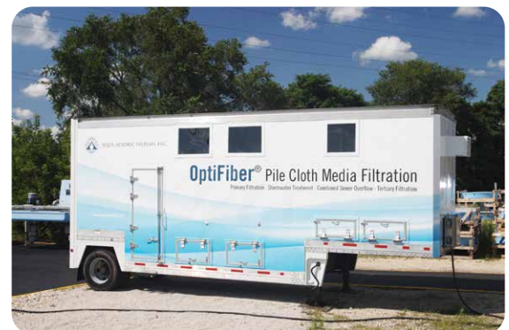
OptiFiber® Primary Filtration Pilot System