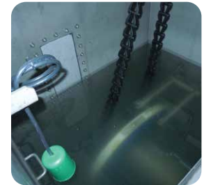
A single Aqua MiniDisk® is utilized in the filtration tank.