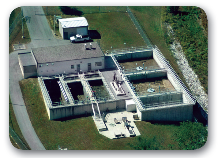
Abbottstown's dual-basin AquaSBR® system is shown to the right.

effective alternative and the system would accomodate the future stringent effluent requirements for ammonia and phosphorus.