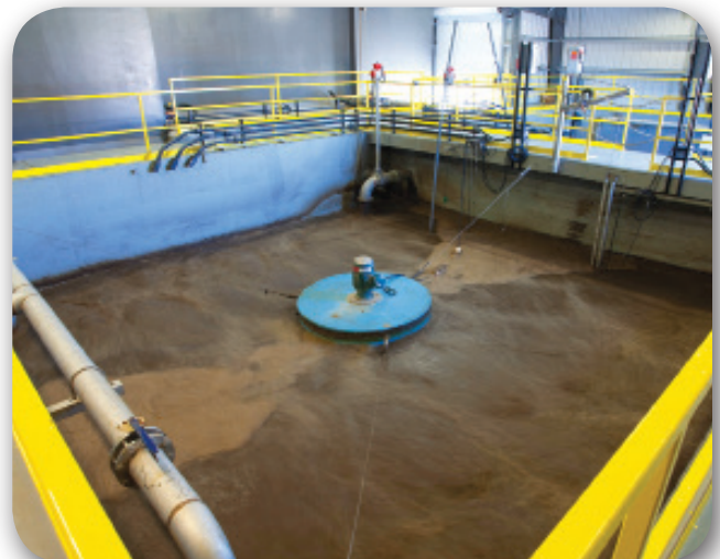
One of Quechan Casino's batch biological reactors.

was expected to go from < 2% to nearly 100% capacity in one day! Because of Aqua-Aerobic Systems' unique, early startup plan, Quechan Casino avoided the large expense of hauling seed-sludge.