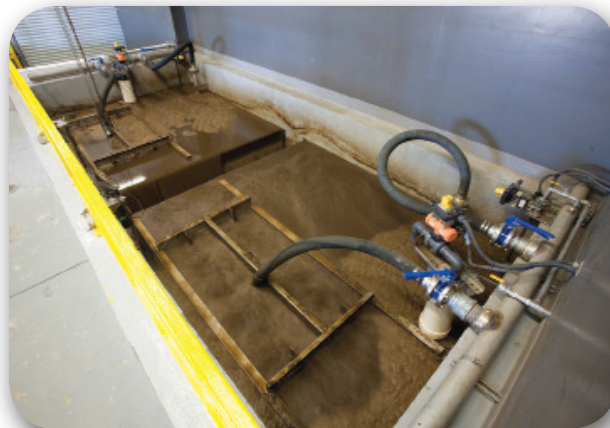
Quechan Casino's membrane module in air scour mode.

The system was actually started up a month before the casino opened in order to get the biomass to necessary levels for treatment of the Grand Opening flows. The flow