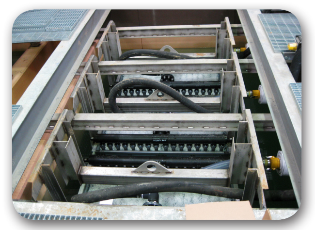
Shown are Aqua-Aerobic® MBR submerged membrane modules.

Most convincing was the low cost of ownership over the life of the plant compared to other technologies that were evaluated.