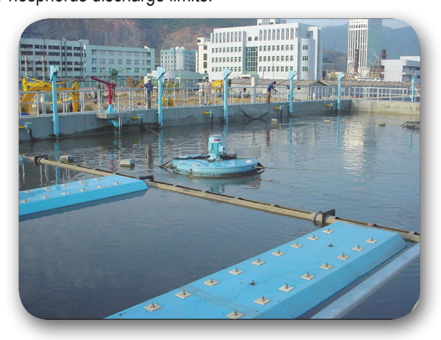
One Aqua MSBR® cell at Shenzhen Yantian WWTP. Shown is (1) AguaDDM® mixer with local control station and (2) Air Weirs.

Increasingly stringent permit limits on effluent BOD5, COD, TSS, Ammonia-Nitrogen and Total Phosphorus determined the need for a new wastewater treatment plant. Due to the limited land space and environmental sensitivity of the port area, Shenzhen had to design a new plant with technology that offered a small footprint and enhanced nutrient removal capabilities that addressed the particularly stringent Total Phosphorus discharge limits.