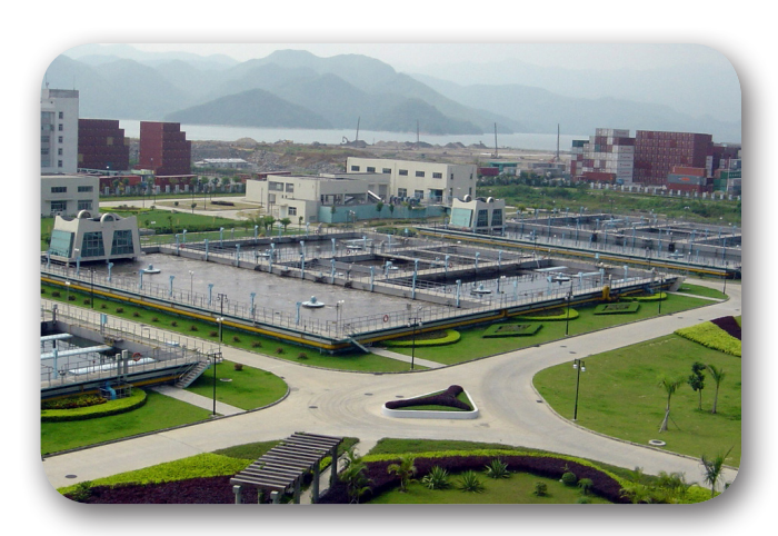
One of three Aqua MSBR® reactors at the ShenzhenYantian WWTP.

Following their investigation of nutrient removal technologies, the city chose to install an Agua MSBR modified sequencing batch reactor system. Plant construction was divided into two discrete phases. The first phase began in early 2000 and the second in December of 2001.