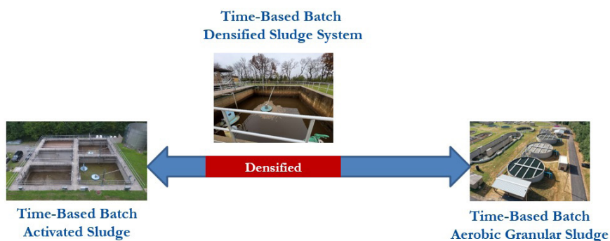
Figure 1. Examples of different types of suspended growth technologies at work: AquaSBR® Sequencing Batch Reactor (activated sludge, left), Aqua TruDense™ True Densified Sequencing Batch Reactor (densified sludge, center), and AquaNereda® Aerobic Granular Sludge (granular sludge, right)

size, which is established using selective feed and waste processes (Figure 1). Activated sludge particles are typically smaller than 200 \mu\text{m} , and mixed liquor suspended solids (MLSS) is typically 3,500 to 4,500 \text{mg/l} . Densified sludge has more compact flocs composed of particles ranging between 200 \mu\text{m} and 400 \mu\text{m} . The denser particles settle more quickly, creating more concentrated mixed liquor (5,000 to 5,500 \text{mg/l} ). This improves nutrient removal over traditional activated sludge.